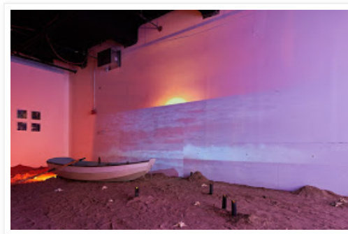
Entre Nosotros (Between Us) Variation I