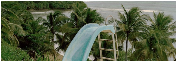
Image: Christopher Gregory, Yabucoa Tennis Club, 2017, chromogenic print. on view at Isla imaginaria, curated by Natalia Viera Salgado.

Exhibition dates: April 19 - May 4, 2018