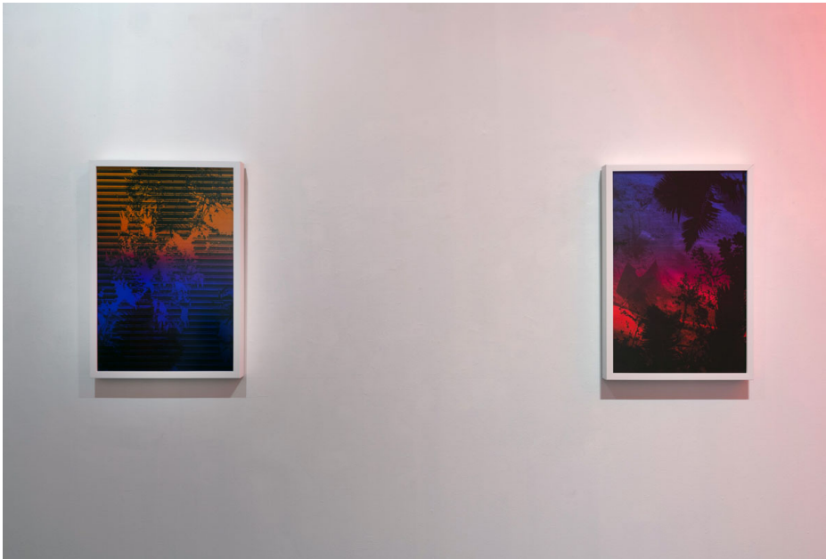
Lionel Cruet, Dusk / Daybreak (2020). Installation view.

Yi Gallery is pleased to present an exhibition of new works by Lionel Cruet, on view from August 21 through September 19. With a photographic aspect, focusing on the ecological state of coastal spaces, Dusk/Daybreak is a series of experimental digital prints that capture daylight transitions using bi-tone pigmented gradations.